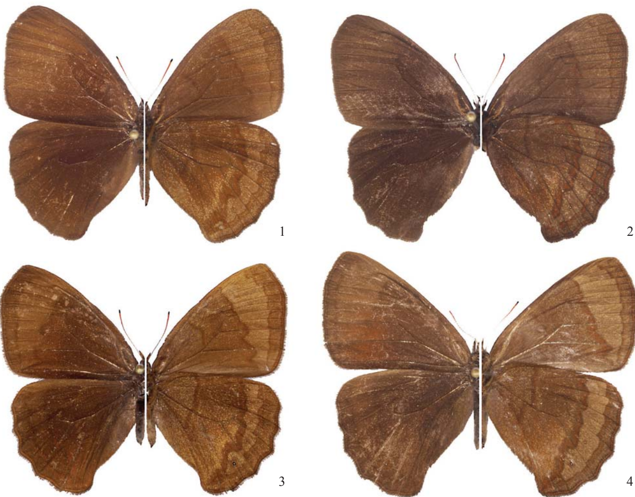
Figs 1-4. Eretris julieta 1. Male (HOLOTYPE), dorsum/venter ; 2 Male (PARATYPE), dorsum/venter ; 3-4 Female (PARATYPE), dorsum/venter.

noticeably dark brown undulated submarginal line. FWV light brown, very light, pale brown in postmedian to submarginal area; a medium brown, arched median line across discal cell; a crimson red-brown postmedian line, straight from costa to Cu1, zigzagging from Cu1 to anal margin near tornus; a light brown submarginal band, delicately incised along veins, with a darker, medium brown basal edge; marginal area dark brown. HWV ground colour same as on the forewing, with a delicate yellowish suffusion turning heavier towards outer and anal one-third, particularly along inner margin of postmedian line between M3 and 1A; a crimson red-brown, median line from costa to 1A, gently curved basally towards the extremities; a crimson red-brown postmedian-submarginal band, slightly sinuate, with one deeper basal protrusion in Cu1-Cu2; a series of 3-5 min, barely noticeable vestigial ore very small ocelli, in cells Rs-M1 to Cu1-Cu2, the most prominent of which is invariably the one in Cu1-Cu2; an orange-brown submarginal line with shallow incisions on the veins, converging with postmedian band in Cu2-1A near tornus; the area between submarginal and marginal lines a shade darker brown than the remainder surface of the wing; marginal area dark brown. Genitalia (Fig 5): Uncus stout, slightly (1/5) longer than tegumen, straight except for